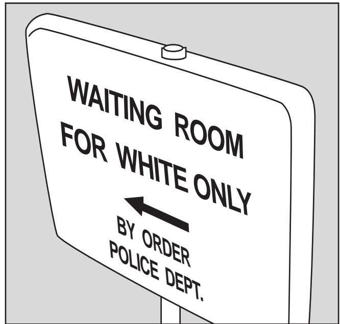
Black Americans were denied access to many public places.

Although it was to take much longer to integrate all Americans economically and fully into society, the official period of reconstruction was over.